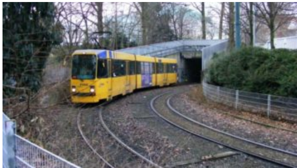
Essen in Germany with excellent Tram-Tunnel entrance